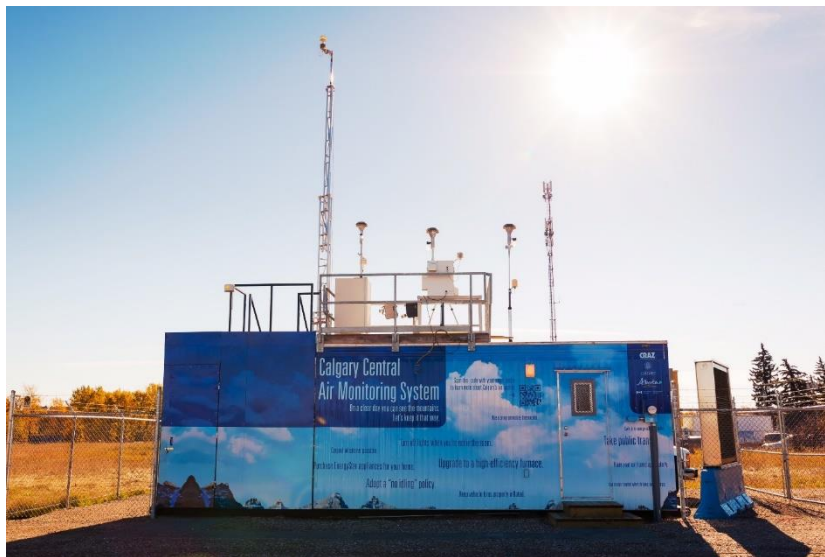
CRAZ Central Air Monitoring Station

In its 18-year history, CRAZ has established comprehensive baseline air quality data throughout the region for key air quality parameters and has acted on behalf of all residents within the Calgary Metropolitan Area to respond to mandatory management planning in response to elevated air quality levels. CRAZ also operates the provincial ambient air quality monitoring program within its boundaries, including four permanent monitoring stations located in Calgary and Airdrie; owns and operates a portable air quality monitoring laboratory that can be deployed in response to local air quality areas of interest and has supported a number of collaborative education and engagement programs throughout its region, often bringing industry resources to enrich such programs.